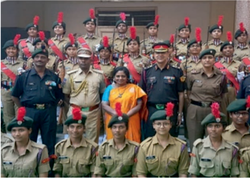
NCC Cadets of RBVRR Women's College along with Dr TAMILISAI Soundarajan, Governor of Telangana